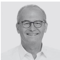
Claude Turmes Former Minister for Energy, Former Minister for Spatial Planning Former Member of the European Parliament